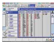
IOs logical view