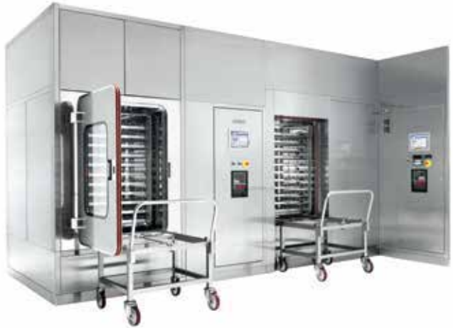
FOFxx + FCDVxx Saturated steam sterilizer + Chemical bio-decontamination unit