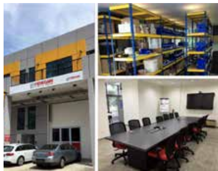
FEDEGARI ASIA PTE. LTD.