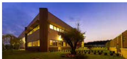
NEW INOX SRL