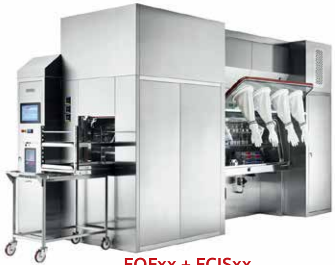
FOFxx + FCISxx Saturated steam sterilizer + Isolator