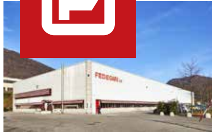
FEDEGARI (SUISSE) SA

Besides the companies belonging to the group, Fedegari can rely on 2 commercial partners (Steritech Ltd. in the UK & Steritech SA in Belgium) and on about 50 regional representatives all over the world that act as system integrators and are a benchmark in their own countries for Fedegari philosophy, values and products.