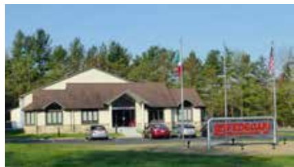
FEDEGARI TECHNOLOGIES, INC.